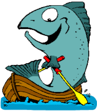
The FISH! philosophy is simple: Work can — and should! — be fun