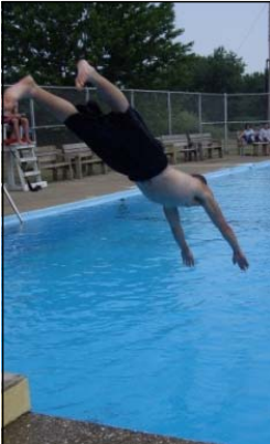
Clients are making good use of the agency pool during this summer's unusually hot, dry weather